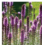
Liatris full sun