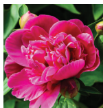
Peonies full sun