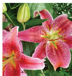
Lilies full sun to part shade