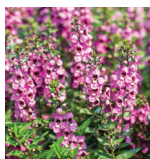
Snap Dragon full sun