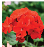
Geranium full sun