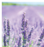
Lavender full sun