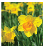
Daffodils full sun