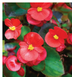
Begonia part shade