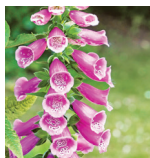
Foxglove full sun to part shade