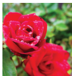
Roses full sun to part shade