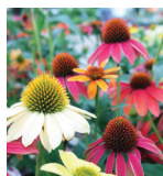
Coneflower full sun