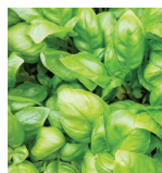
Sweet Basil (herb) full sun