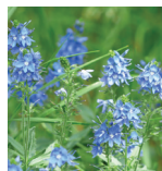
Veronica full sun