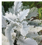
Dusty Miller full sun to part shade