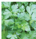
Parsley (herb) full to part sun