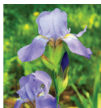
Iris full sun to part shade