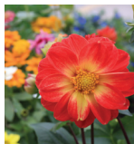
Dahlia full sun