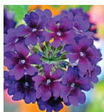
Verbena full sun