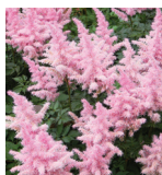
Astilbe part to full shade