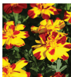
Marigold full sun