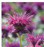
Bee Balm full sun