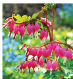
Bleeding Heart part sun to full shade