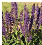
Salvia full sun