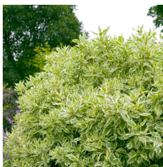
Large Dogwood Types